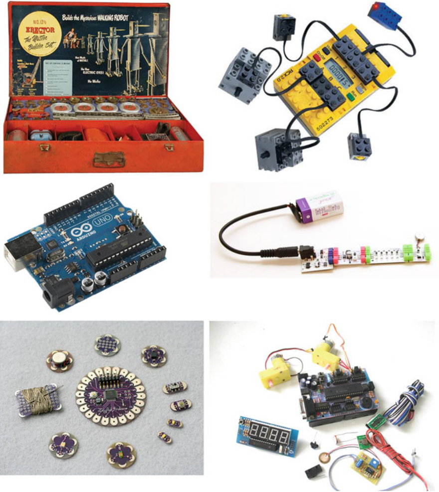
Fig. 4 The evolution of technology kits for children: the Erector Set (1940s), the Lego Mindstorms kit (1998), the GoGo Board (2001), the Arduino (2005), the Lilypad (2006), and LittleBits (2011)

education. Some of the seminal papers on digital fabrication and physical computing for children were published at IDC. Mike Eisenberg, in a visionary and trailblazing paper, first proposed the use of new “output devices” such as 3D printers in education (Eisenberg 2002), and Leah Buechley pioneered the use of e-textiles and new, flexible materials (Buechley 2006; Buechley and Eisenberg 2008).